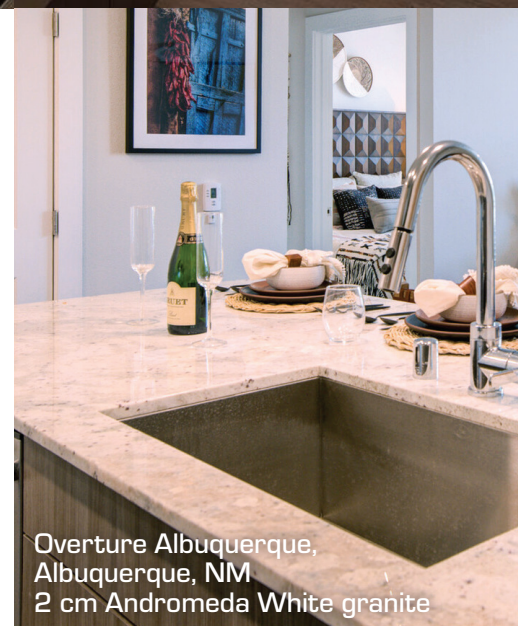
Overture Albuquerque, Albuquerque, NM 2 cm Andromeda White granite

Upon request, we can provide undermount pressed and man-made kitchen and ceramic bathroom sinks. Contact your salesperson for additional information.