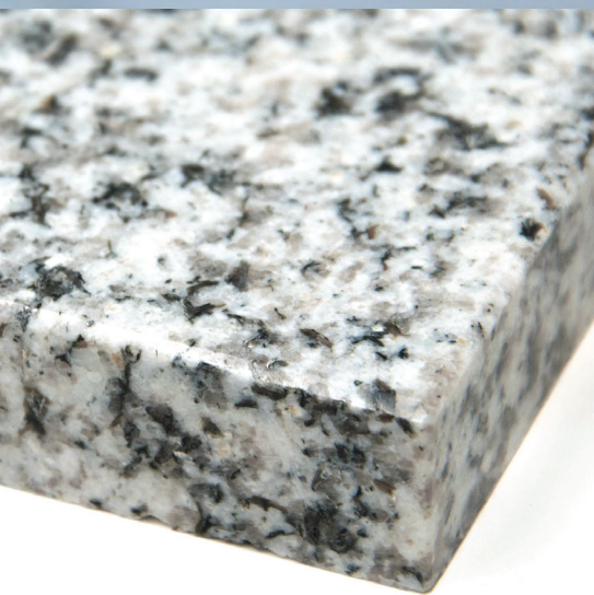
2 cm Moonlight White corner detail