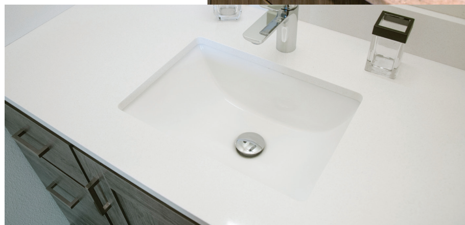
Alder Springs, Eugene, OR 2 cm Cascade White quartz