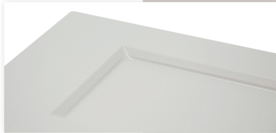
recessed panel detail (FASHION GREY)