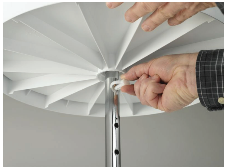
Patented Snap-Pin support