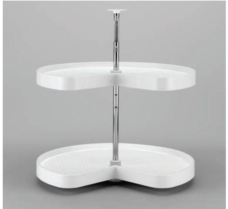
28" W x 28" D x 26-31" H