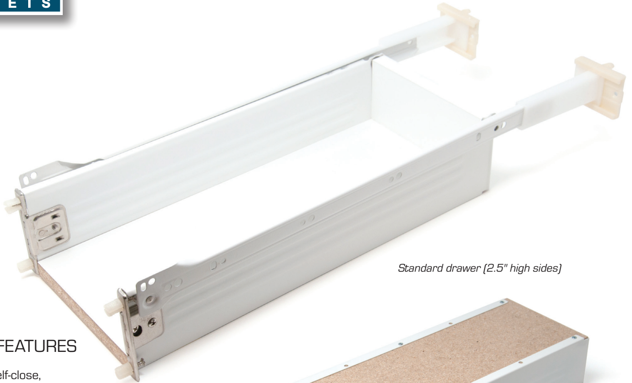
Standard drawer (2.5" high sides)