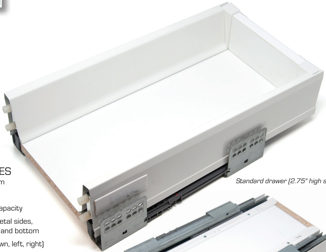
Standard drawer (2.75" high sides)