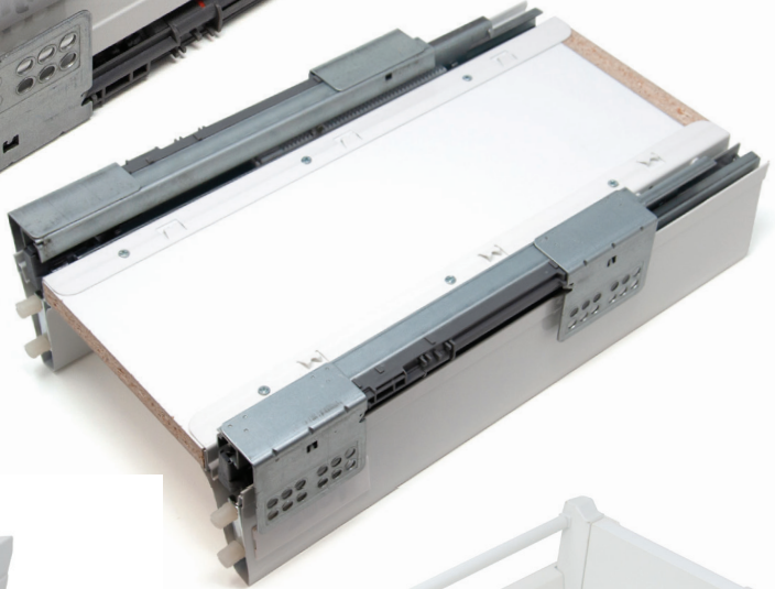
Deep drawer (4.75" high sides)