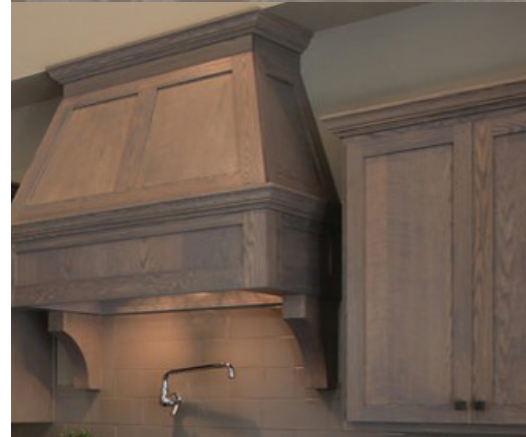
PACIFIC 3/4" x 1 1/2 - 4 1/4"

Available in face frame construction only. Wood stained to match face frame.